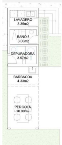
PLANTA BAJA EXTERIOR